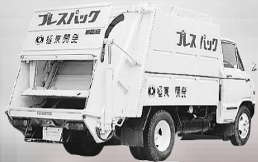
[ Compactor ]