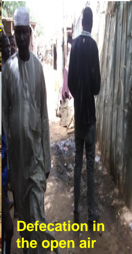
Defecation in the open air