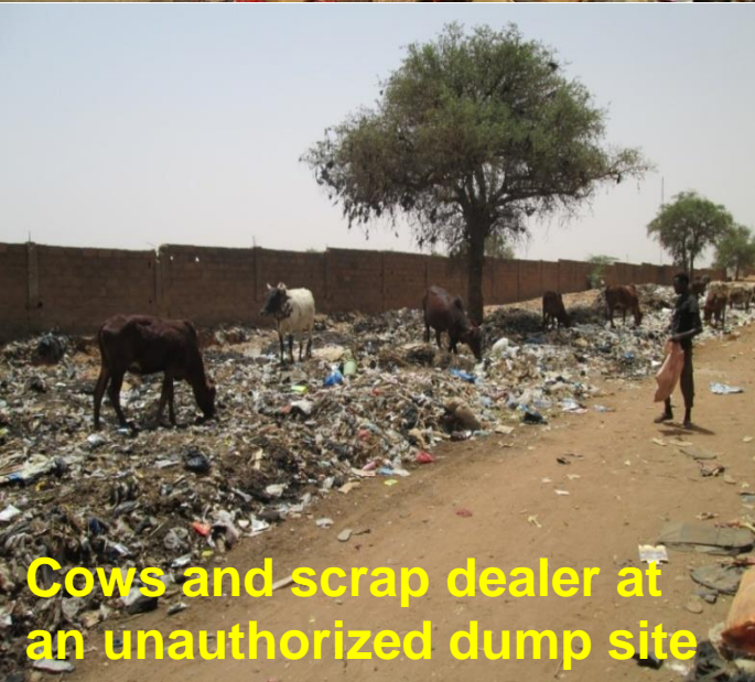
Cows and scrap dealer at an unauthorized dump site