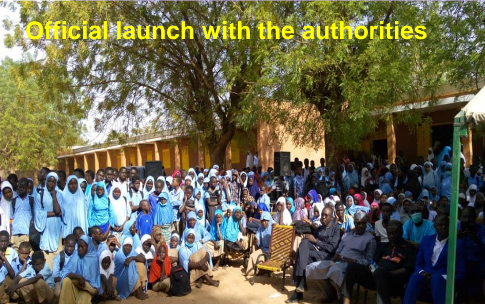
Official launch with the authorities