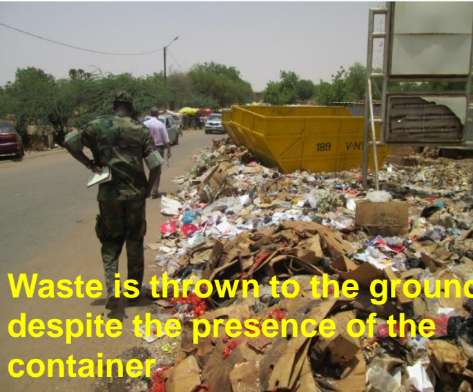
Waste is thrown to the ground despite the presence of the container