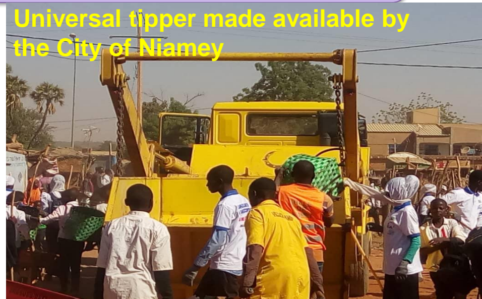
Universal tipper made available by the City of Niamey