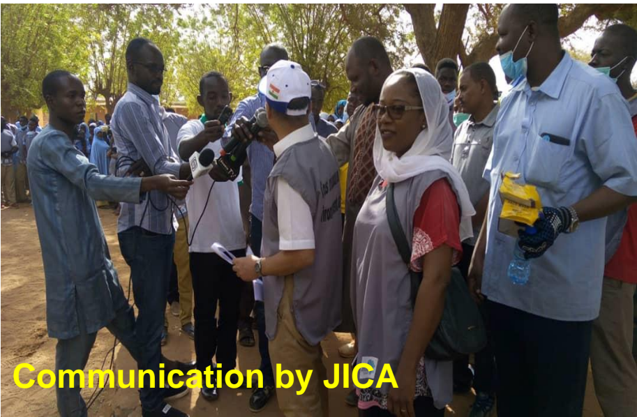
Communication by JICA