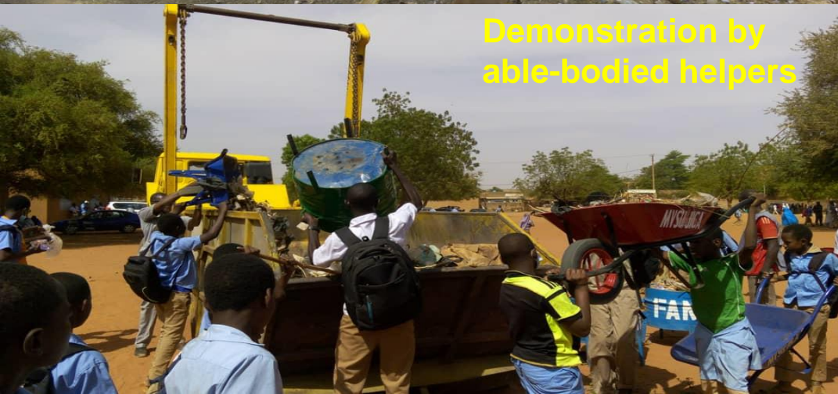
Demonstration by able-bodied helpers