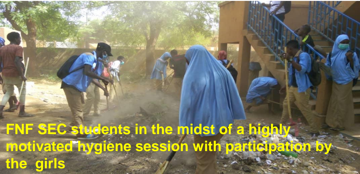
FNF SEC students in the midst of a highly motivated hygiene session with participation by the girls