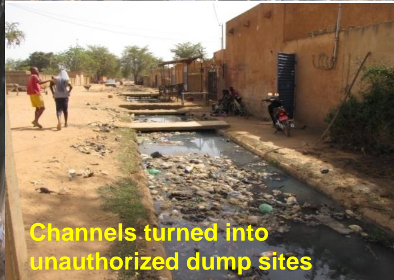
Channels turned into unauthorized dump sites