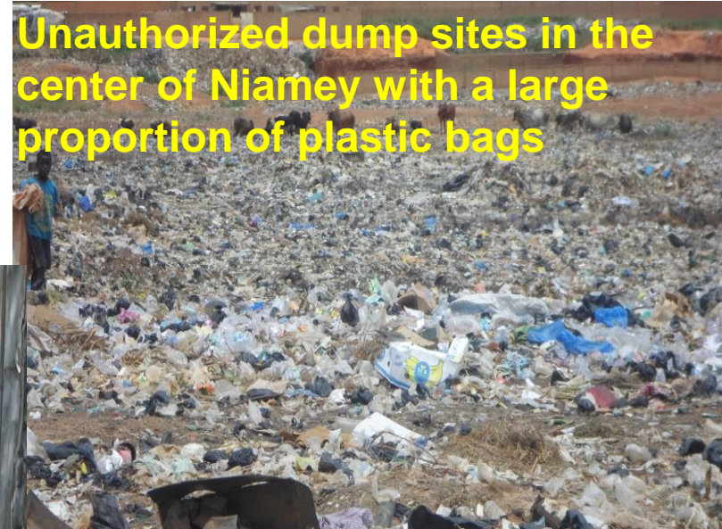
Unauthorized dump sites in the center of Niamey with a large proportion of plastic bags